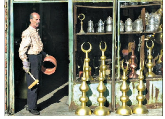
Ankara, Page 6