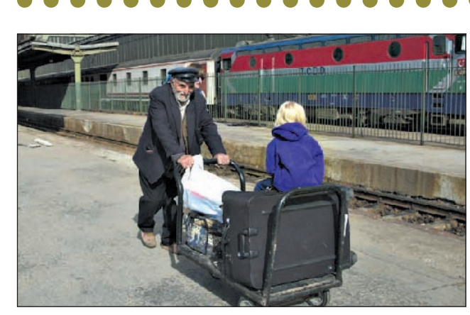
Turkish rail, Page 3

Massive ancient statues draw tourists to mountain in Turkey, Page 10